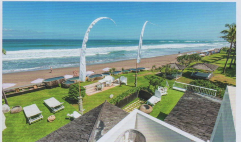
LEFT: SET UP, MORABITO STYLE; THIS PAGE: RETURN TO SPLENDOUR.