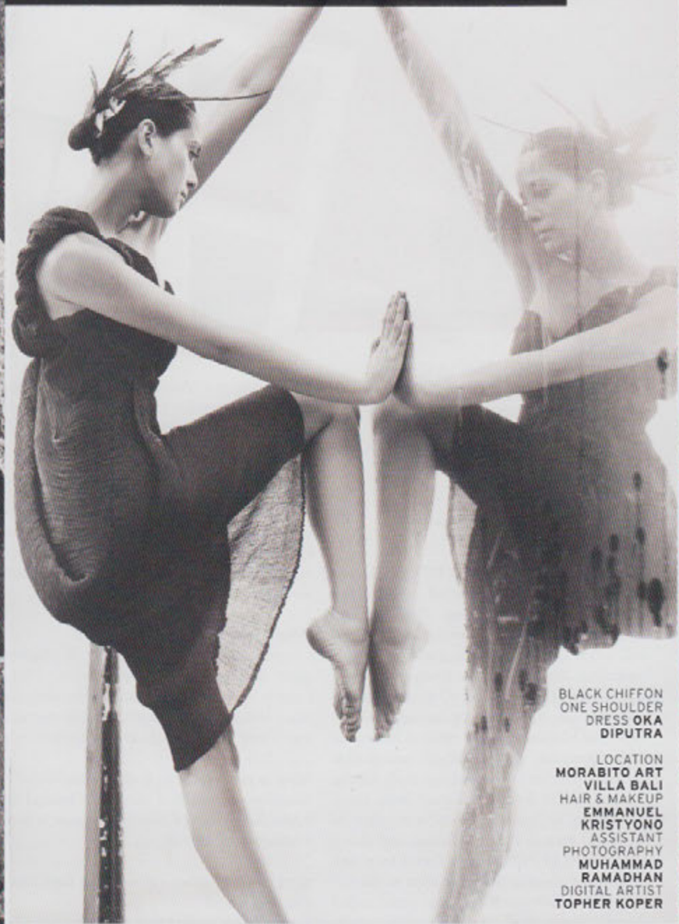
BLACK CHIFFON ONE SHOULDER DRESS OKA DIPUTRA