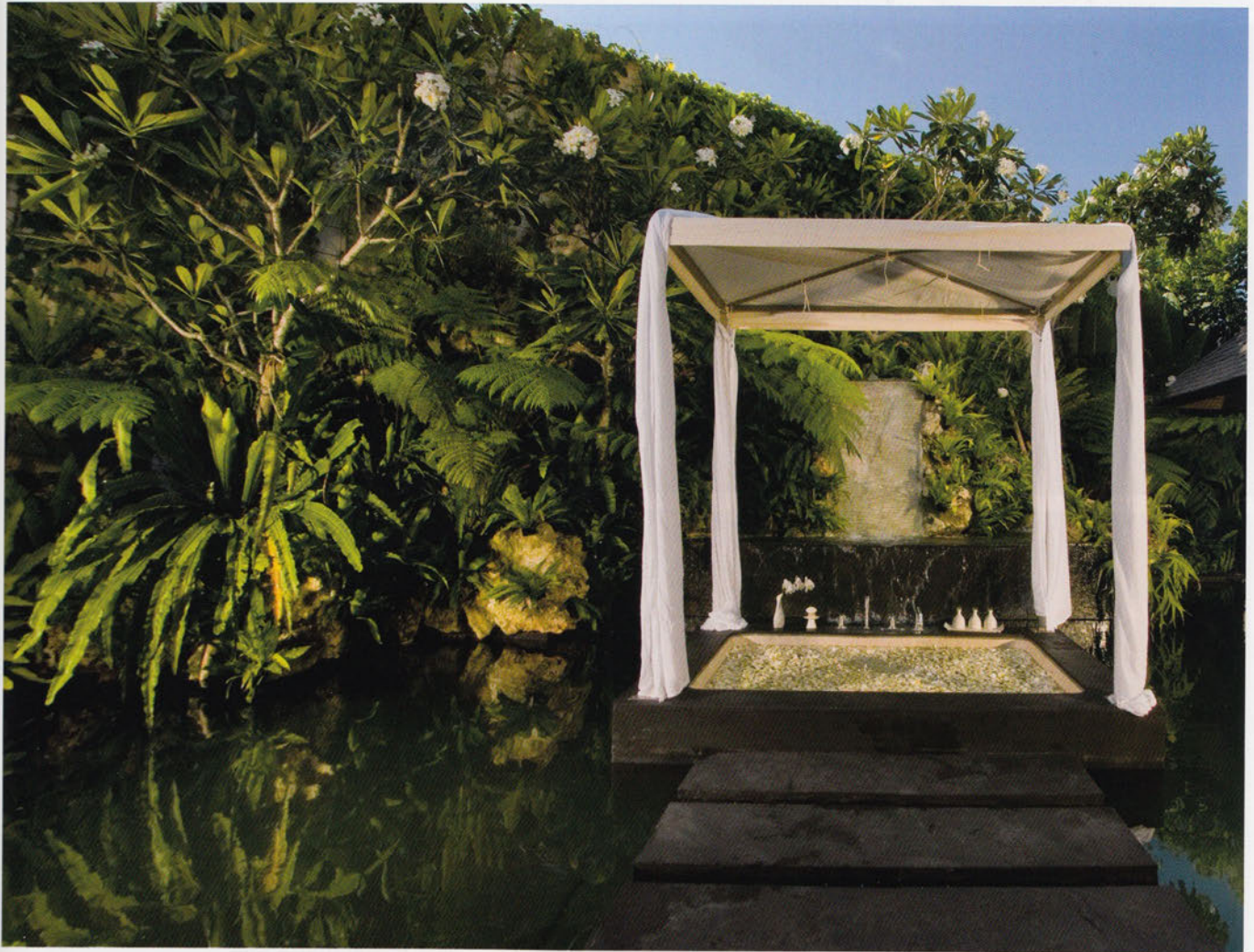
SEVENTH HEAVEN – The very name recalls the dwelling place of the Gods – a mysterious realm above the clouds. Indeed the lavish bathtubs at Khayanagan might just put heaven within reach. Prepare to be spoiled. www.khayanganestate.com