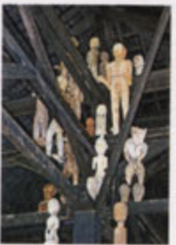
CLOCKWISE FROM TOP LEFT Bolare suite night; Bolare suite; Collection of stone statue from Java; The Museum; Lavish settings for an event

released another book expressing the depth of his genius. Taking photographs of shoes and floors using a digital camera, Pascal was able to delve into a childlike vision, expressing great freedom and giving light to fashion trends and human behaviour. With over 80,000 photos, the book, 'Mes Pas Dans Vos Pas,' was an outstanding achievement. In 2004, Pascal heralded a new series of geometrically pure lamps for Lampe Berger. This partnership with Lampe Berger continued with the release of a novel collection, after which Pascal, turned his attention to a property in Bali, designing its plans, opting for minimalist room concepts that incorporated Balinese art.