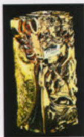
FROM TOP Breakfast at Morabito Art Villa; Bretelle et Jarre; Compression d'or

"I LIKE UNITS THAT CAN BE DUPLICATED. LIKE A MOLECULE I CAN MAKE COMBINATIONS WITH"